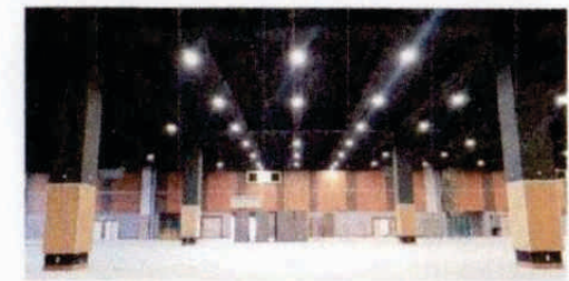
Kinabatangan I, II & III