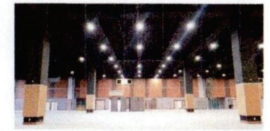
Kinabatangan I, II & III