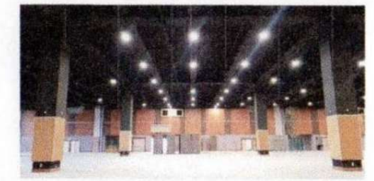
Kinabatangan I, II & III